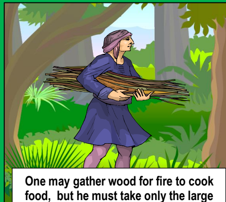
One may gather wood for fire to cook food, but he must take only the large twigs and leave behind the small ones