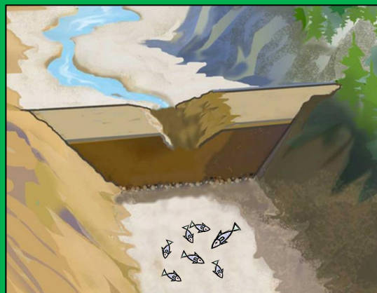
But one must make another opening for the water on the lower level to flow out. That way, it is clear that one wants to catch fish and not irrigate the field.