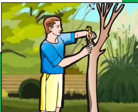
One may cut branches from his tree to feed animals but he must cut off the branches only on one side.