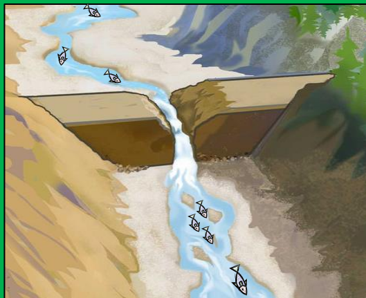
One may cause water to flow from a higher level to a lower level to collect the fish in the lower level

If someone wants to feed his animals on חול המועד, he may cut off branches from a tree in order to do so. But one may not cut off branches in order to prune a tree. רַבָּא says, he can show that he wants to feed his animals by cutting the branches off of only one side of the tree. Cutting branches in this way does not prune the tree so it is clear he wants to use the branches for his animals.