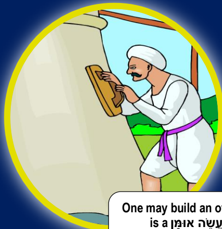
One may build an oven if it is a מעשה אומן (professional job) since it is used to make food edible