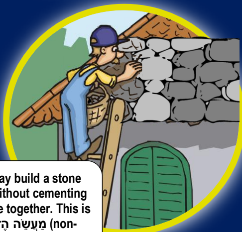
One may build a stone fence without cementing the fence together. This is a מעשה הדיוט (non-professional job)