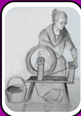
Spinning: The long soft fibers that remain are spun into linen thread