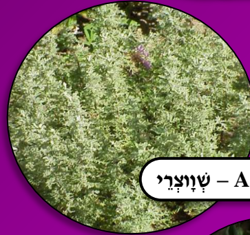
שׁוּפְרִי – Artemisia