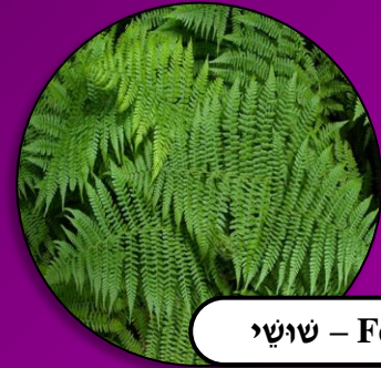
שוּפִי – Fern

אַבְיִי warns against using artemisia because it has a very foul smell that will cause people to leave the סוּפָה entirely!