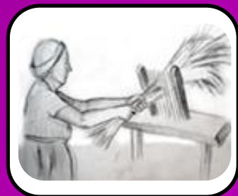
Hackling: Fibers are combed to remove the remaining stem bits and to separate the long fibers from the short ones