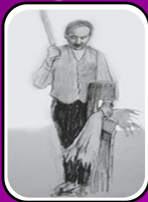
Scutching: Beating the stems to separate the fibers from the stem