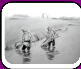
Retting: Soaking flax stems to loosen the fibers