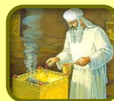
Sprinkling goat and bull blood on the מזבח הזהב (Golden Altar)