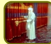
Sprinkling goat and bull blood on the פרוכת (curtains)