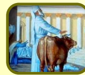
וידוי (confession) on the bull