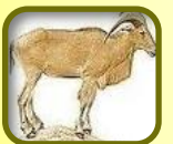
Offering the rams