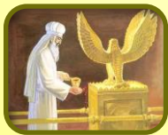
Sprinkling blood in front of the ארון

עבודות (ceremonies) performed in white clothes inside the קדש הקדשים (Holy of Holies)