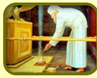
Burning קטרת (incense) in front of the ארון (Ark)

עבודות performed in white clothes outside the קדש הקדשים