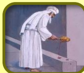
Pouring leftover blood on the Altar