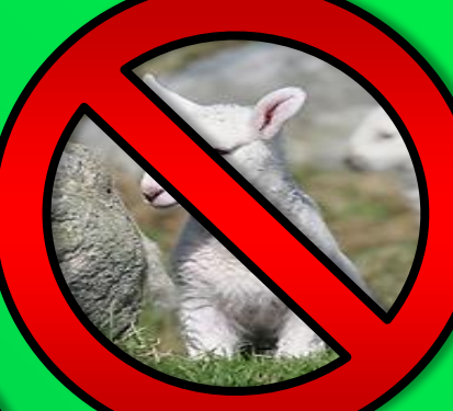
Can't Be Less Than 8 Days Old