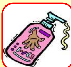
Putting on lotion