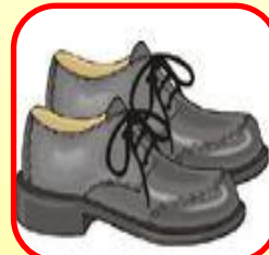
Wearing leather shoes